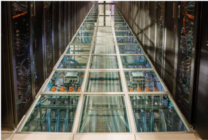
The supercomputer at Sandia National Laboratories with the under-floor automatic failover valves that enable the system's N+1 smart redundancy to maximize uptime.

Sandia National Labs deployed Manzano supercomputer at their Albuquerque HPC data center with Chillydyne's negative pressure liquid cooling system. Chillydyne's cooling solution reduces the computer system's energy use without risk of leaks.