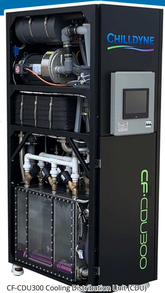
CF-CDU300 Cooling Distribution Unit (CDU) cools up to 300 kW of servers in high-density applications.

Chillydyne delivers dependable leak-proof direct-to-chip liquid cooling solutions for HPC, AI, Data Centers, Finance, Colocation Service Providers, Hyperscalers, Government, and Academia. Our patented, fail-safe systems use advanced negative pressure technology and smart redundancy to prevent leaks and maximize uptime. Easy to install and maintain, Chillydyne’s solutions ensure unmatched cooling performance for a sustainable approach to managing your server environment.